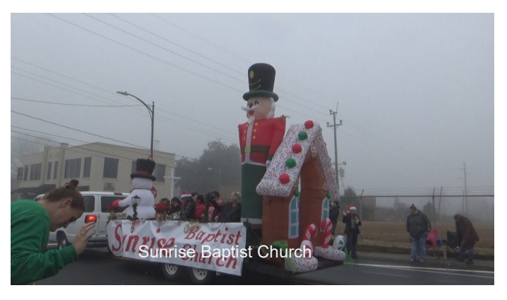
Note: The editor could not identify three of the entries. If you recognize any of them, please let her know using the contact information below.